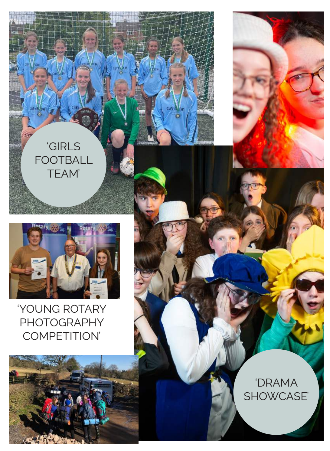
'DUKE OF EDINBURGH'